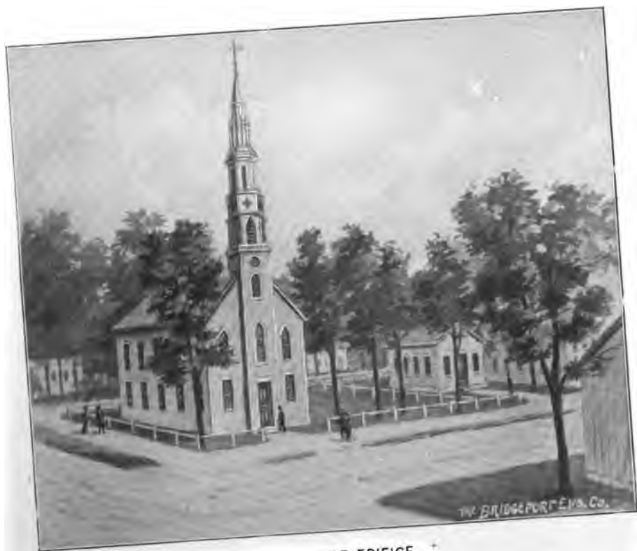
THE THIRD EDIFICE.